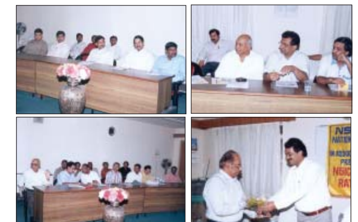
Members attended VAT awareness programme