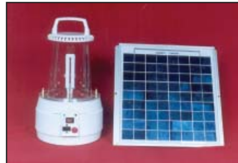
PRAKASH Solar Light