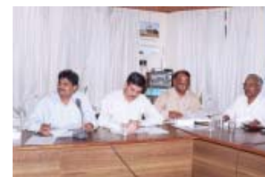
Members attended to the ELIAP EGM programme