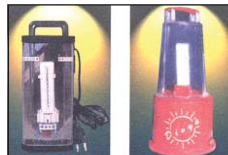
DIVYA Emergency Light