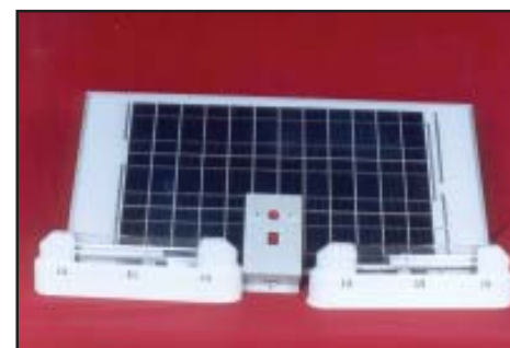
AKHANDA Solar Indoor Light