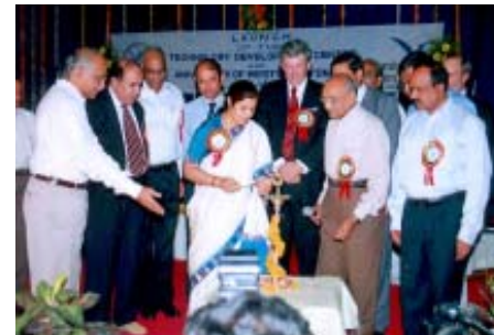
Mrs. Daggubati Purandareswari Devi, Minister of State for HRD officially launching TDC by lightening the lamp